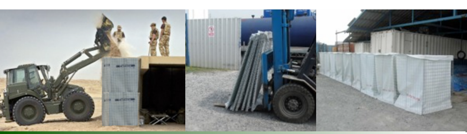
Benefits CeTeau Emergency (Flood) Wall

The CeTeau Emergency (Flood) Wall, by virtue of its matchless strength, excellent engineering adaptability and proven reliability, has become the chosen building material for a tremendous variety of construction work. These include road construction, river training, weirs, control and retaining of flood water, earth retaining structures, coastal defense, harbor works, erosion control, bridge protection and military applications.